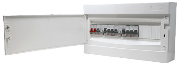
G18I-7A (New 18 Module wide enclosure)

Assembled at our facility in Ireland. Special boards can be tailor made for specific customers & projects.