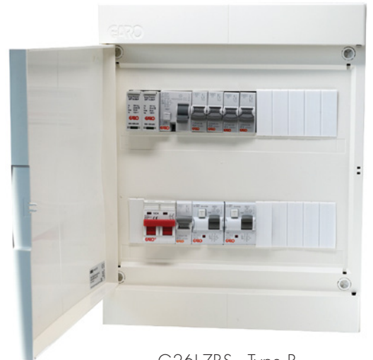
G26I-7BS - Type B

Both the A and B ranges of GARO Consumer Units fully comply with all requirements within I.S. 10101:2020. All components come with a comprehensive 5 year warranty.